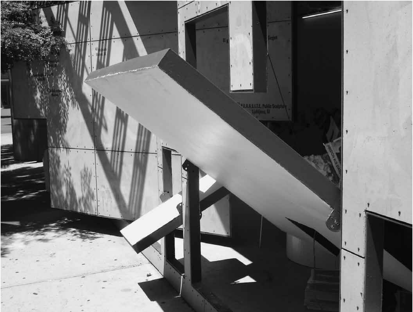
Figure 3. Acconci Studio. The Storefront for Art and Architecture , New York, 1993. Post-2008 reconstruction (Photo: A. Forster).

a spectacular proposal for a kind of updated Crystal Palace in which spectators would lose their observer/audience status and participate in a delirious range of diversions concocted through cybernetic and physical systems in a completely re-configurable building interior. In 1971 the Seventh Congress of the International Council of Societies of Industrial Design (ICSID) took place in Eivissa (Ibiza), Spain. Alongside the formal proceedings was a parallel series of encounters which was “not just an open congress where professionals and students could meet and debate; it was a point of convergence between design and the most experimental forms of art and architecture at the time in Spain.” 31 Among these was Instant City , conceived by Carlos Ferrater and Fernando Bendito, a massive modular inflatable village made of plastic, which was home to a social experiment involving collective design, meetings, dinners, and other events.