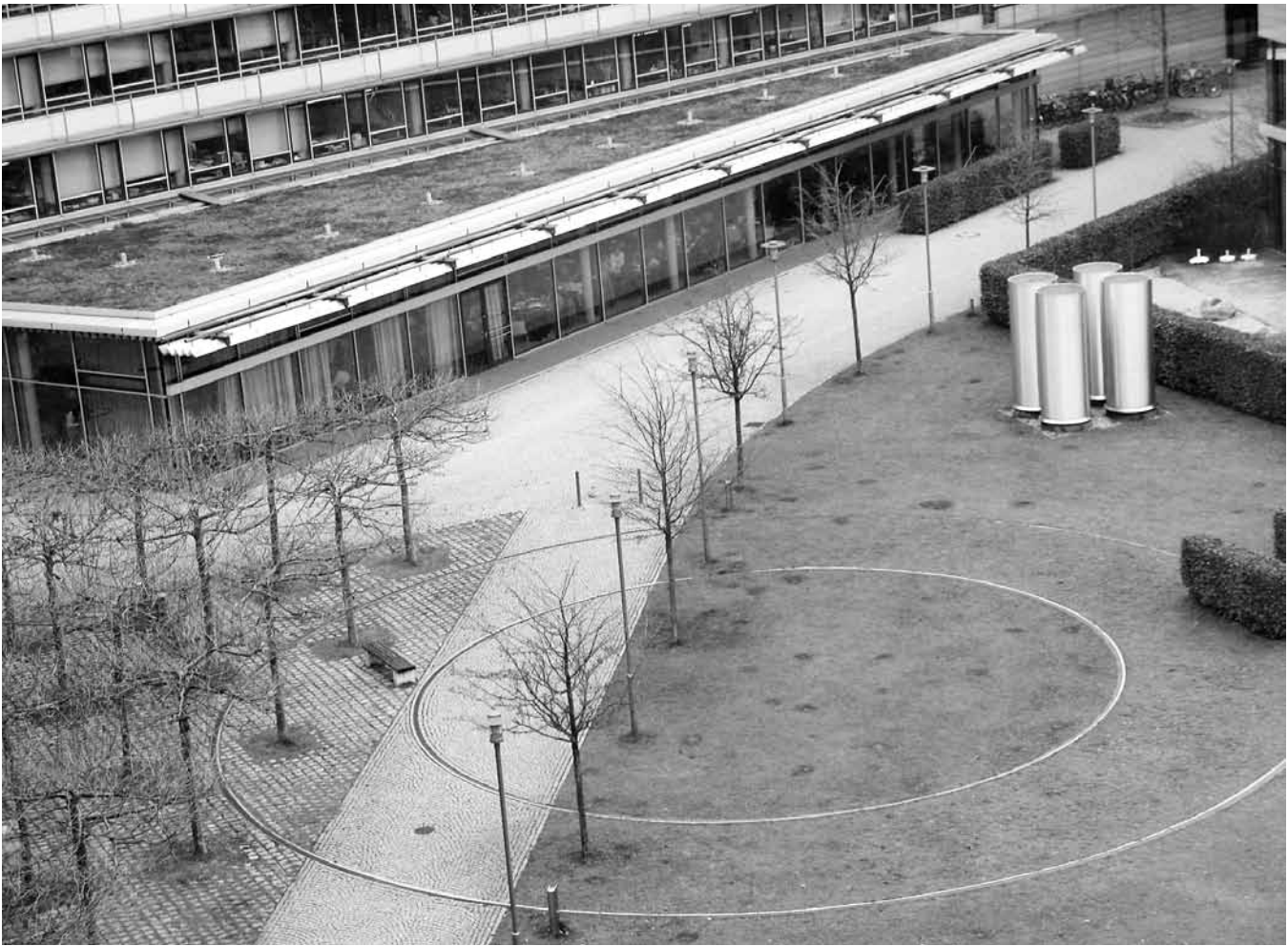
Figure 5. Acconci Studio. Courtyard in the Wind , Munich, Germany, 1997. Tower, turbine and courtyard.

The Storefront for Art and Architecture , designed in 1993 in collaboration with architect Steven Holl, animates the very facade that defines a building from the outside or a room from the inside, taking this basic boundary of place as precisely the thing to be brought into play, and once again literally flipping the public into the private (figs. 2 and 3). It recalls the slapstick rotating walls in Buster Keaton's famous parody of building, One Week (1920), in which Keaton builds a pre-fab house, but completely mis-builds it, having lost the instructions. He opens a door and it has the sink attached to it, now on the outside of the house. It is a film of gags based on displacement and physical discomfort. Storefront is the beginning of a formal strategy (hinted at in House up the Building and Park up the Building ) that continues through much later work, where floors and walls turn into seats and tables, where gardens go vertical, ceilings become ground, where paths wander off-axis, and civic space is floated offshore. This