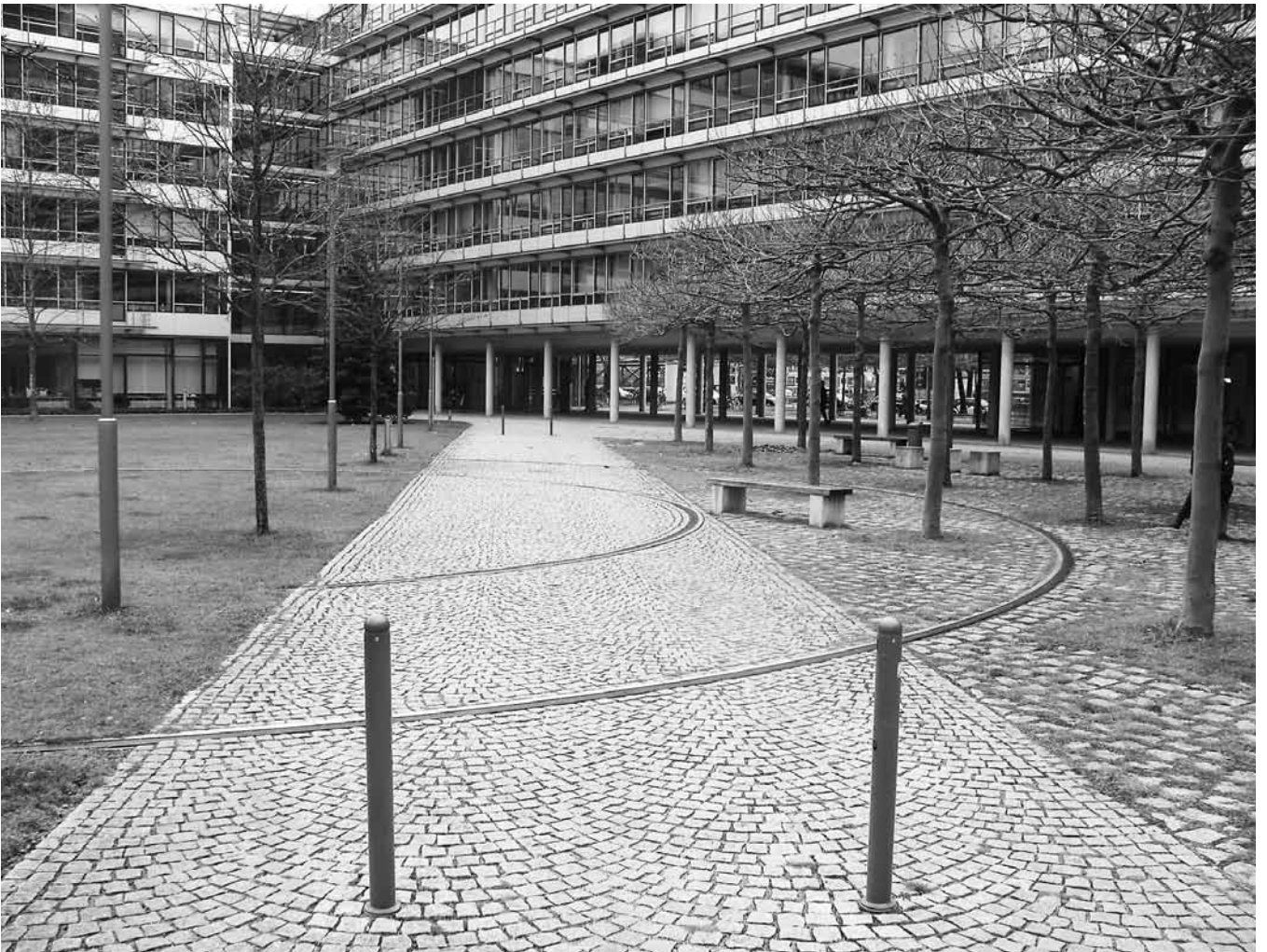
Figure 4. Acconci Studio. Courtyard in the Wind , Munich, Germany, 1997. Tower, turbine and courtyard.

place where the terms of the made world are to be loosened or un-fixed, where one can actually get at and change the grounding of the design process, is also central. 33 Acconci's play begins at the threshold of public and private space and extends beyond the hermetic boundaries of the art world in a conversation contextualized by experiment and implication in urban space. He explains, "We do think of a peopled space, so that we can take hints from the program, we like to double the program, or multiply the program, we like it not to have just a single program." 34