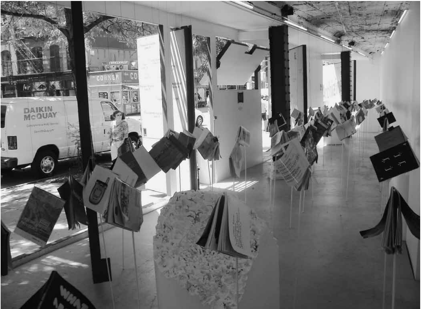
Figure 2. Acconci Studio. The Storefront for Art and Architecture , New York, 1993. Post-2008 reconstruction (Photo: A. Forster).

architectural program.” 30 Archigram’s science-fiction-like conjectural drawings and collages, far from being propaganda for positivistic technocratic utopias (in the mode of Le Corbusier or brutalism) were a collision with the future where technology served to create a new ecosystem of the built that questioned the very grounds of the discipline and conjectured buildings that were not fixed objects or monuments, but rather might move, or be evolved by their users, or disappear altogether. Archigram’s was a polemic practice in which a light-footed tuning to the logic of particular technologies became a device or a gambit for upsetting the kind of architecture that technology is habitually geared to maintain. They posited not a technology that keeps control but one that wanders according to a momentary logic of use—a Trojan horse in the house of techno-culture. Just as Acconci suggests that words might become “fact” and wander from the page into the city as a “continuation of poetry by other