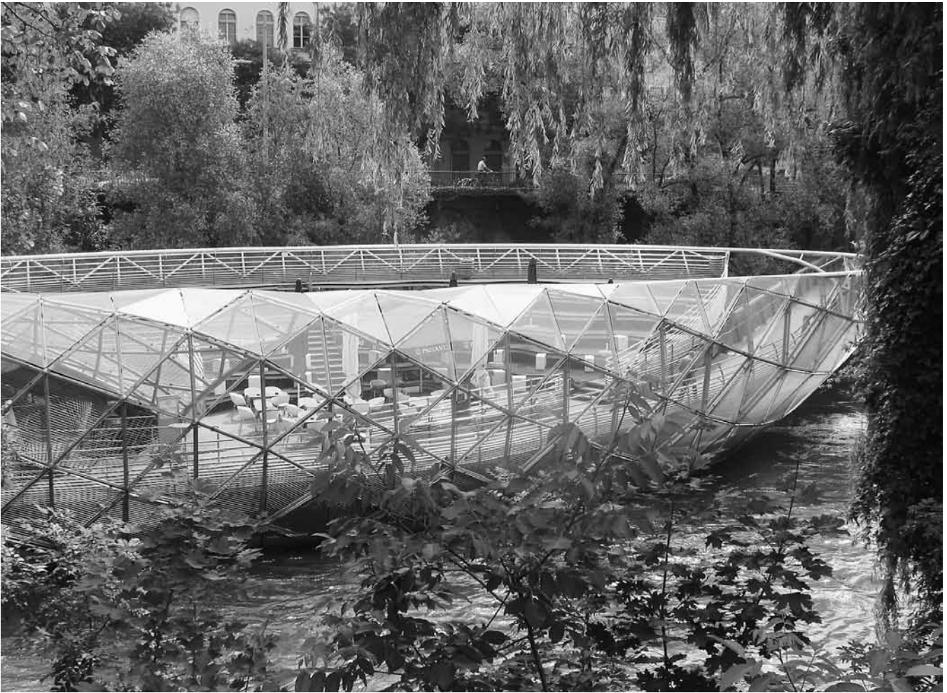
Figure 7. Acconci Studio. Mur Island , Graz, Austria, 2003.

preoccupied with the visual atmospheric of sensorial experience (beauty?), Acconci seeks to articulate places of spatial seepage and discomfort (impurity?). The sensitivity to public space as event (or parade) aligns Acconci Studio clearly with discussions pertinent to the field of landscape architecture. If architecture needs to be resisted, perforated, even collapsed, it is in order to have a conversation with landscape as built public place: “I think building should melt into landscapes, and landscapes can maybe develop into buildings... I did start thinking of public space and of architecture as, let’s walk into, across the monument. Let’s bring the monument back to the ground we’re standing on.” 36