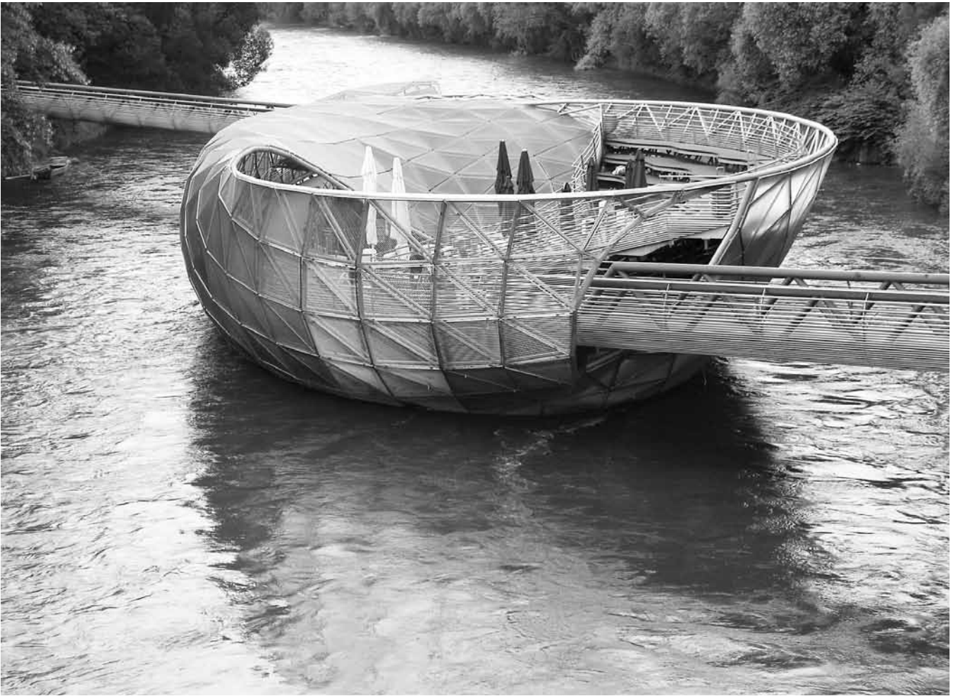
Figure 6. Acconci Studio. Mur Island , Graz, Austria, 2003.

made at the Bauhaus and its antecedents between pure art and design for production, between the “irrational” and “rational” avant-gardes. Buster Keaton meets Mies van der Rohe.